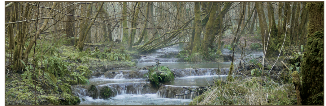
Tufa Dams on the Slade Brook

If you find that the footpath you need is obstructed by crops, walk around the edge of the crops until you reach the next stile.