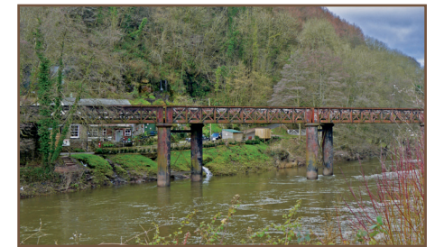
The Viaduct at Redbrook