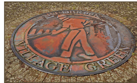
Past industries depicted at Redbrook.

START The walk starts at Newland 1½ miles by road from the Tudor Farmhouse. To get there by car, turn right out of the Tudor Farmhouse and bear right at the village Cross. When you reach Newland park your car and start outside the Ostrich public house. From there continue on foot along the road for 200m to the first stile at point (1) on the map.