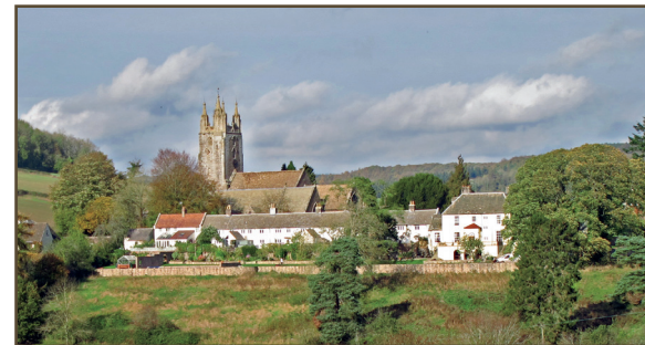
View of Newland village from Rookery Lane

Navigation: The main changes of direction and stiles are marked on the map by a letter. In the Directions, the distance from the previous letter is given e.g. (B-500m) means that B is 500m from the last point mentioned – in this case (A)