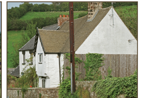
Stank Farm, Clearwell

Tudor Farmhouse Hotel + Restaurant, Clearwell, Royal Forest of Dean GL16 8JS. Tel. 01594 833 046 - Email info@tudorfarmhousehotel.co.uk - www.tudorfarmhousehotel.co.uk