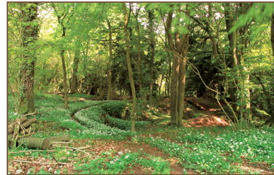
Wild Garlic in Gt. Lambsquay Wood.

If you find that the footpath you need is obstructed by crops, walk around the edge of the crops until you reach the next stile.