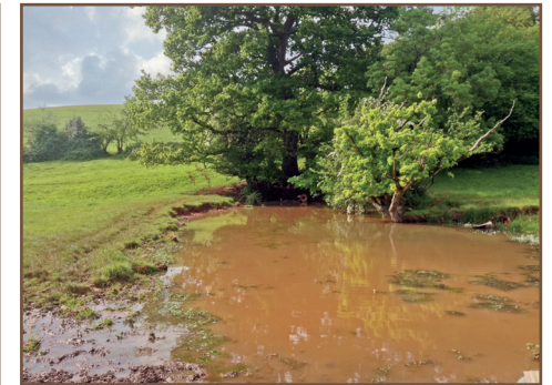
Remnants of an ancient moat.

Tudor Farmhouse Hotel + Restaurant, Clearwell, Royal Forest of Dean GL16 8JS. Tel. 01594 833 046 - Email info@tudorfarmhousehotel.co.uk - www.tudorfarmhousehotel.co.uk