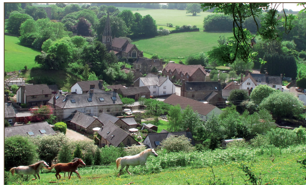
Clearwell from the bank with part of the castle just visible in the trees top left

Equipment: Boots or strong shoes are recommended. Nettles, brambles and thistles may be encountered, a stick can be useful to control them.